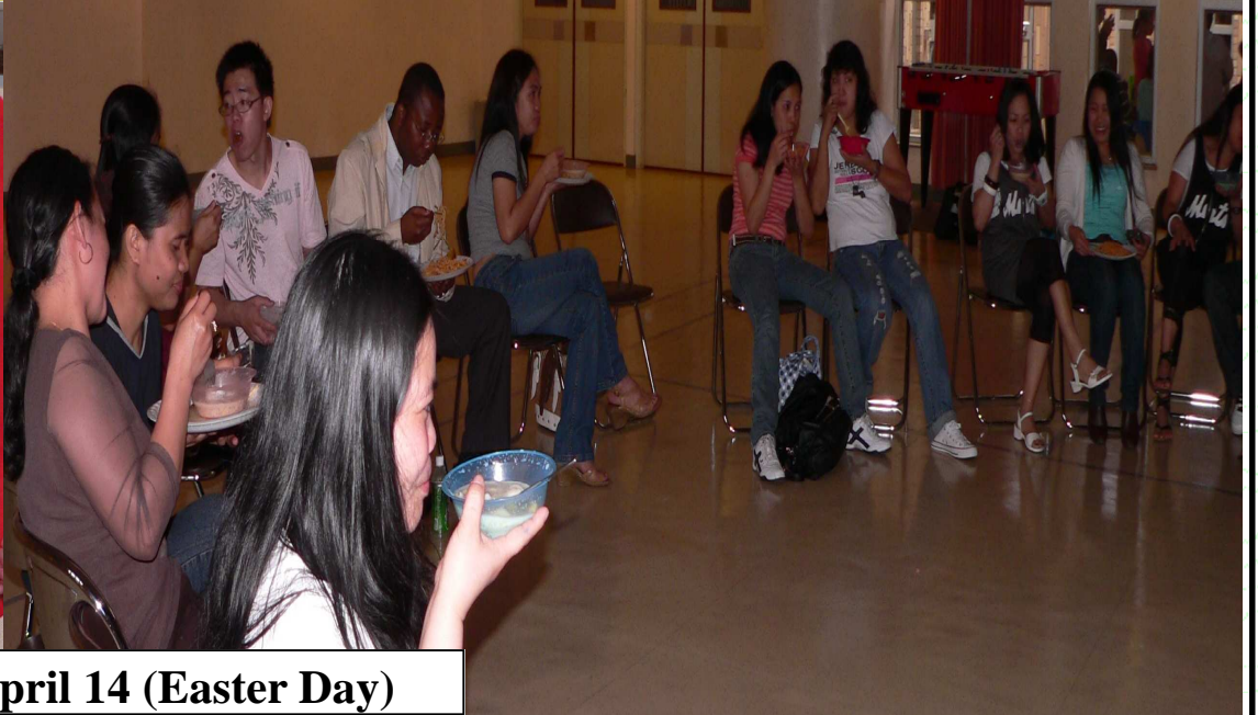
Easter tea April 14 (Easter Day)