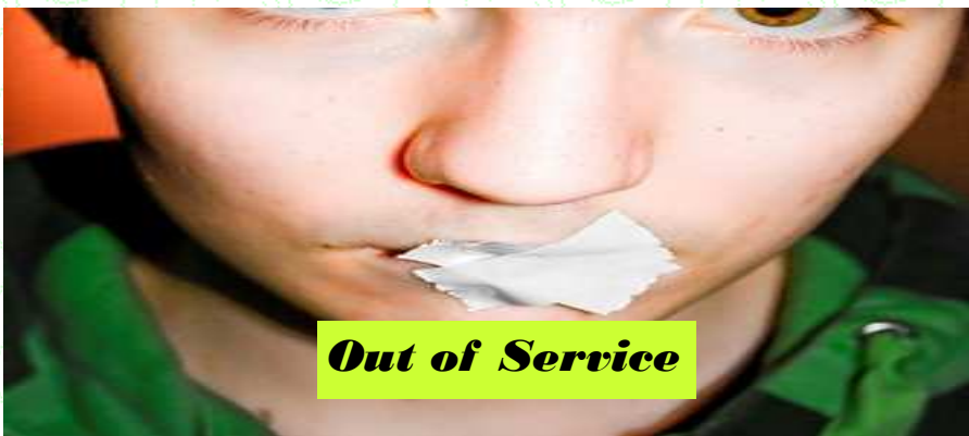
Out of Service