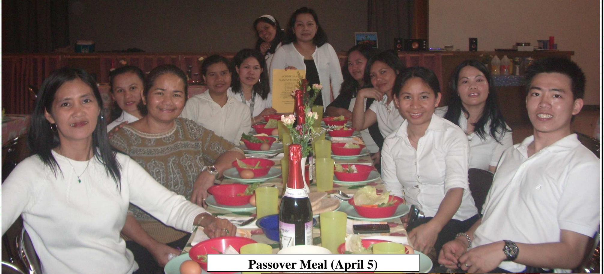
Passover Meal (April 5)