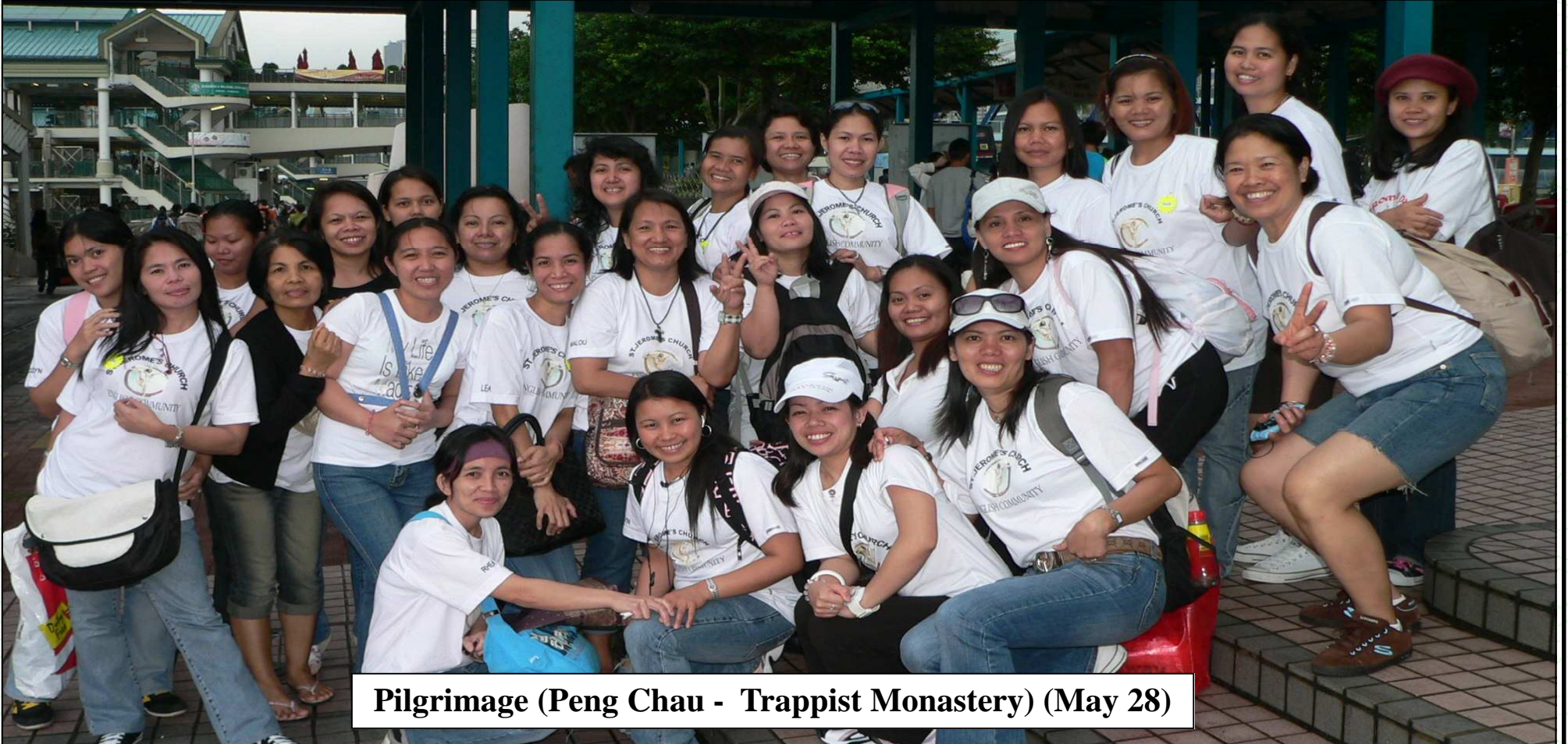
Pilgrimage (Peng Chau - Trappist Monastery) (May 28)