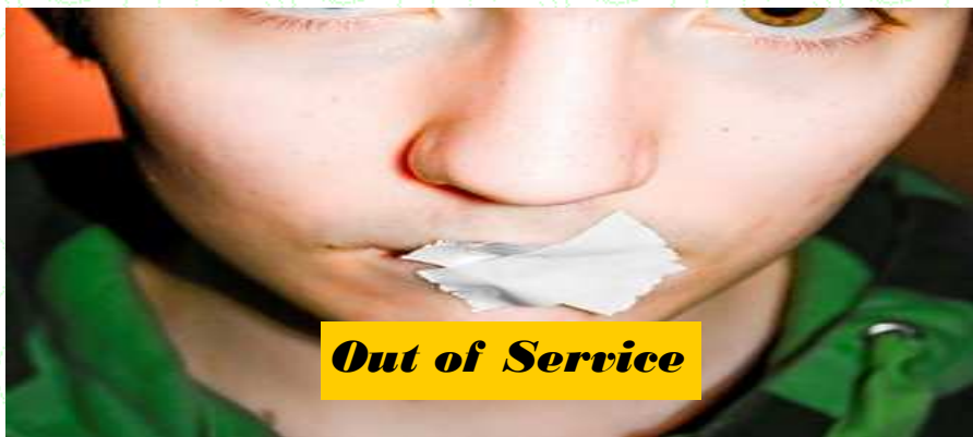
Out of Service