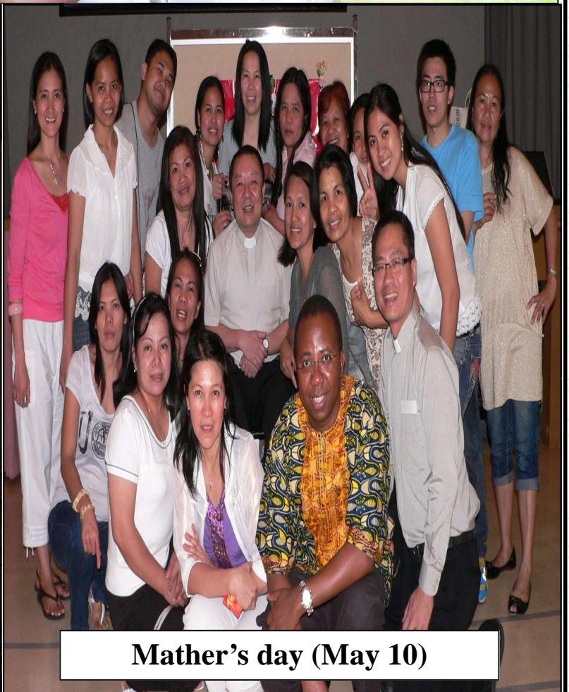
Mather's day (May 10)