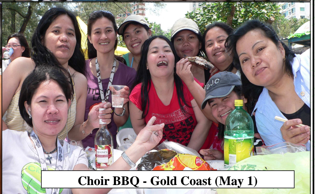
Choir BBQ - Gold Coast (May 1)