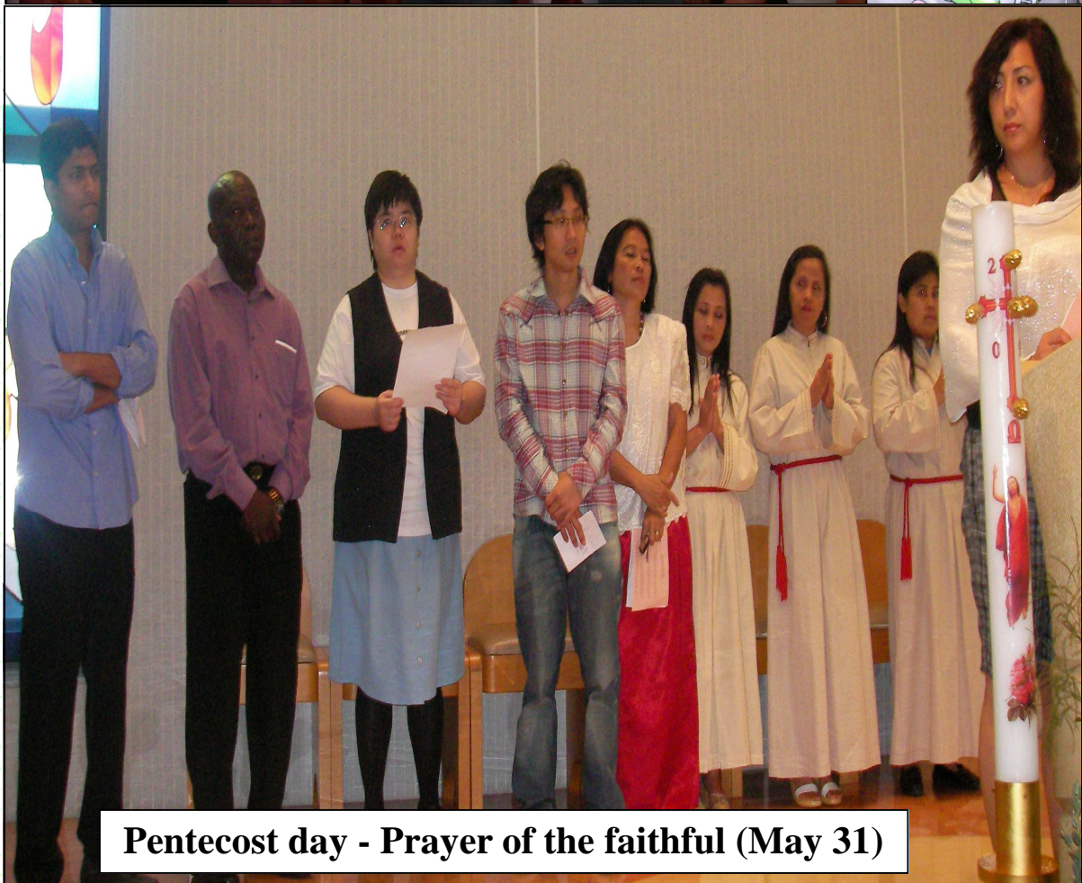
Pentecost day - Prayer of the faithful (May 31)